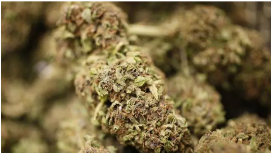
Buds of marijuana are shown before being placed into packets for sale at a cannabis clinic in San Francisco.

THE first cannabis clinic in Queensland was launched today but not everyone will be able to afford its treatment.